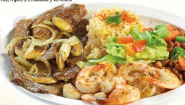
Mar y tierra