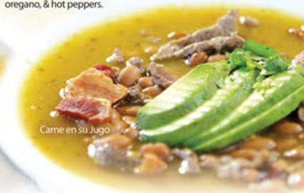
Carne en Su Jugo

Tripe soup served with fresh chopped onions, lime, oregano, & hot peppers.