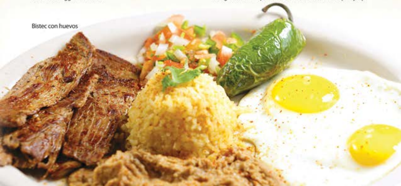
Bistec con huevos

3 large buttermilk pancakes served w/butter & maple syrup.