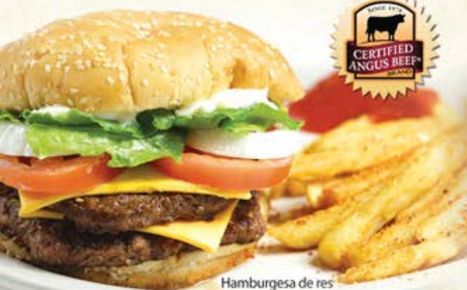
Hamburgesa de res

Grilled beef burger served on an American bun with lettuce, cheese, tomato, onion, mayo and a side of fries.