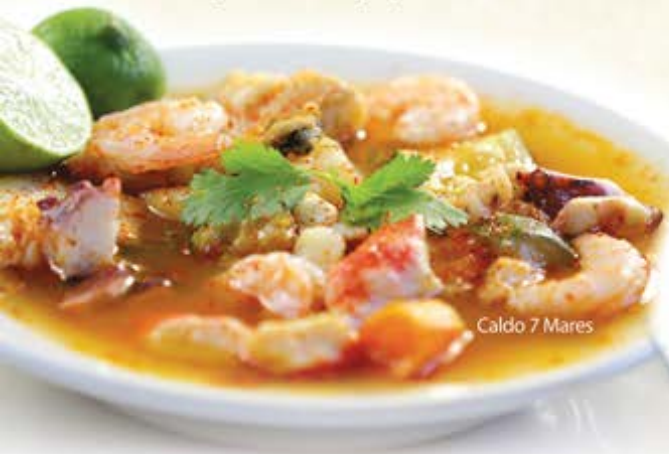
Caldo 7 Mares

Chopped steak, bacon and pinto beans in a beef broth served with green onion, fresh jalapeno and avocado.